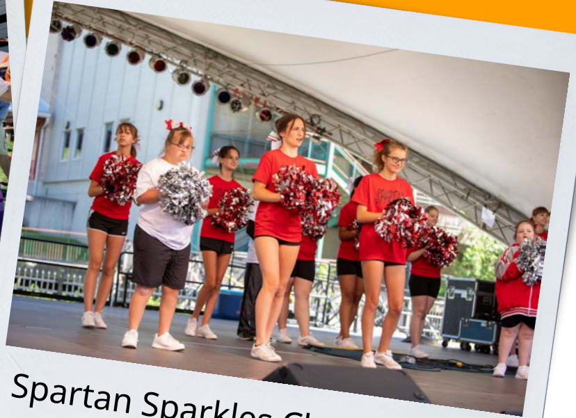
Spartan Sparkles Cheerleaders