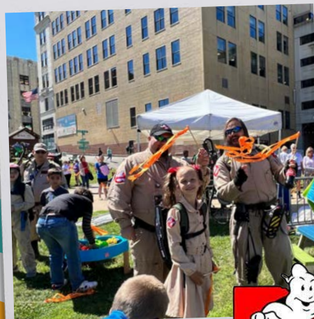
Northeast Ohio Ghostbusters