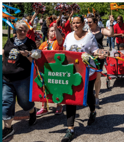
Step Into Autism

In 2022, ASGA expanded "Step Into Autism" to Stark County, supporting area growth initiatives. These family-oriented events bring together people from all walks of life to connect, share and support the human experience of life with Autism.