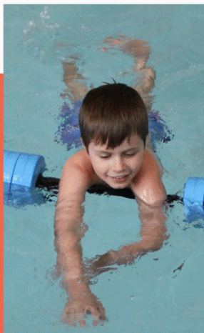
Water Safety Program