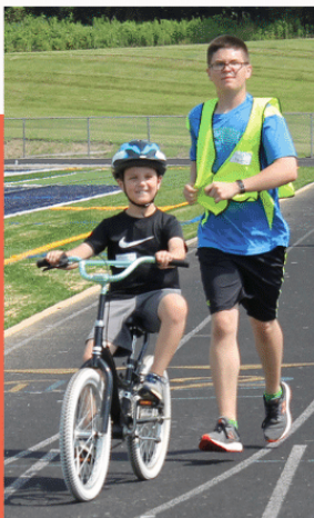
iCan Bike Camp