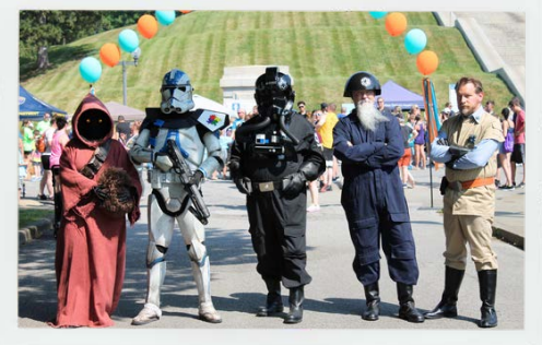
OH 501st Garrison