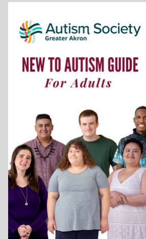
Information and Referral