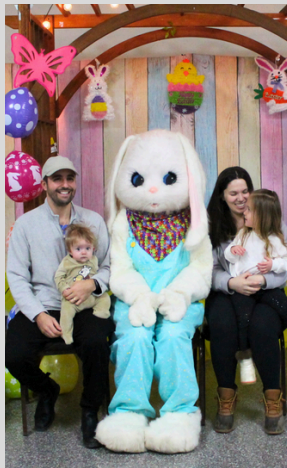
Adapted Community Events